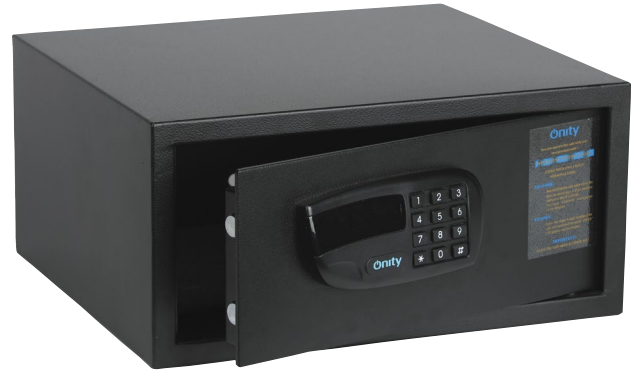
OS100 15IN laptop size