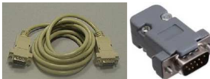
Picture 2. RS485 cable. Color may change. Please note that both ends are DB9 male (left)