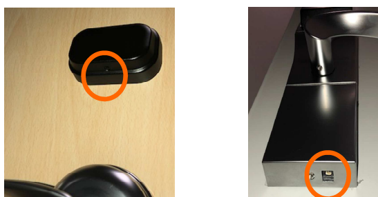
Picture 3 & 4. Advance Trillium lock and Trillium /HT Lock