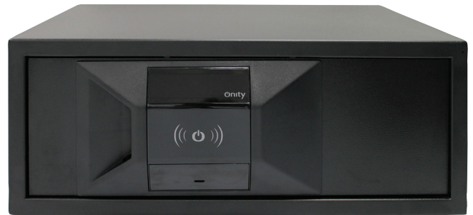
OS700 laptop 17 inch size

Combined with the proven reliability that Onity solutions are known for, the OS700 is capable of accommodating 17" laptops.