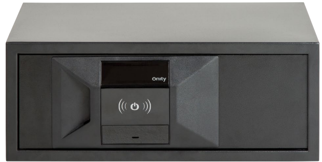
OS700 laptop 17 inch size